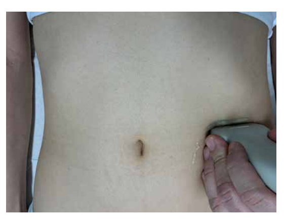
Figure 1. Point of application of ultrasound transducer

The data collected for the purpose of the present study were arranged in a Microsoft Office Excel 2007 spreadsheet. Statistical analysis was carried out using the Statistica Stat Soft program. In order to characterize the analyzed population, basic tools of descriptive statistics were used, i.e. quantitative and percentage descriptions, mean values and standard deviation. For the purpose of comparison of the two groups, Student's t -test for two independent samples was used. In the case of no homogeneity of variance, a non-parametric test, the Mann-Whitney U -test, was applied. The Kruskal-Wallis test was applied for comparison of